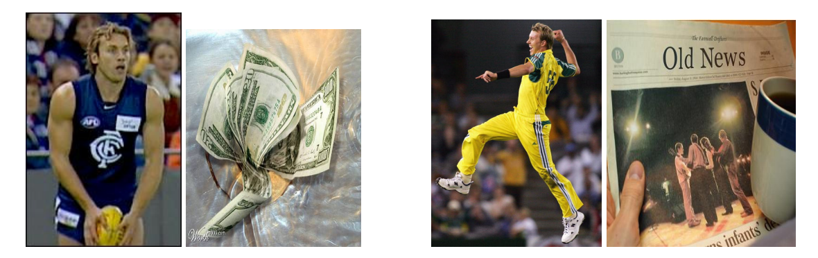
THE END. NO MORE. ALL GONE.